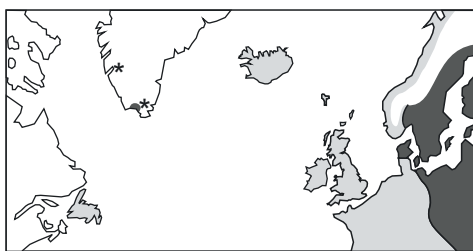
Figure 1 Distribution of M. m. musculus (dark shaded) and M. m. domesticus (lighter shaded) in northern Europe and the North Atlantic region from previously published data and data collected here (Iceland, Greenland, Newfoundland). Areas with no shading either have no house mice or the subspecies distribution is unknown, and areas with some admixture of the two are shaded according to the dominant subspecies. The locations marked with asterisks are sites in Greenland represented by ancient DNA samples. From the mtDNA haplotypes, these were M. m. domesticus derived from the Icelandic population.

For the ancient DNA samples, whole pulverised femurs were incubated in 1.5 ml 0.5 M EDTA pH 8 on a shaking platform for 12 h and the resulting solution spun through a Centricon tube until 200 \mu l of liquid remained. This concentrated liquid was then purified and cleaned using the Qiagen QIAQuick kit [21]. All